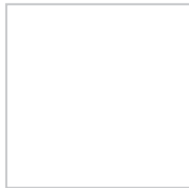
Actual Print Size:

Dotted line indicates maximum print area